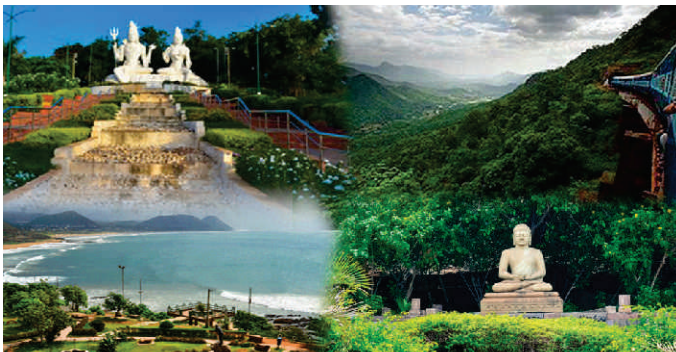
Pristine Beaches, Araku Valley & Buddhist Monastery

Visakhapatnam, the Jewel of the East Coast is crowned with various names such as Port City, Smart City, Financial Hub and City of Destiny is now becoming the Tourism City of the Sunrise State (Andhra Pradesh). The city which has history since 5 th Century of Ashoka & Krishna Devaraya Dynasty until the formation of Dutch colonies in 18 th Century is now poised to attract both International and Domestic tourists.