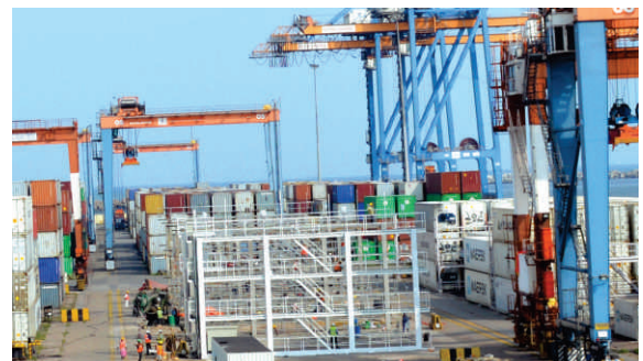
Additional reefer plug points @ VCT

Forecasting the market, along with the exporters other trade players are also gearing up for this spike. Shipping lines have been increasing their fleet of reefer containers to cater to the demand. Visakha Container Terminal too has been enhancing its infrastructure especially the reefer segment at a notch above the desired quantity. The terminal which is already having an adequate 252 Reefer Plug Points is now increased to 396 Points. This development in infrastructure & technology to handle the reefer cargo shall further strengthen the exports from this region.