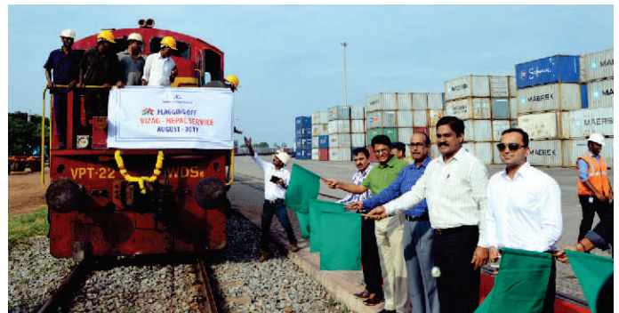
Trade Partners Flagging Off the Rake on 04.08.2017