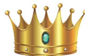
Top Crown to AP