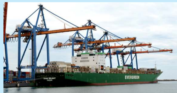
Evergreen's Vessel reached the "City of Destiny" which is the largest LOA in CCG service currently.