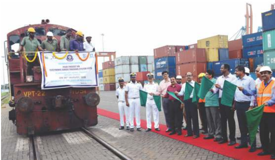
Flagging Off –Nepal Rake

From the customs perspective, the implementation of mandatory affixing of electronic seals for cargo imported via Vizag would mean the elimination of current practice of fixing additional lock in these containers. Besides this, the cargo containers with electronic seals & GPS enabled can be monitored / tracked by them from their office at port, land customs office of Raxaul and Birgunj customs office as well thus facilitating the most secured transport system from Vizag to Nepal.