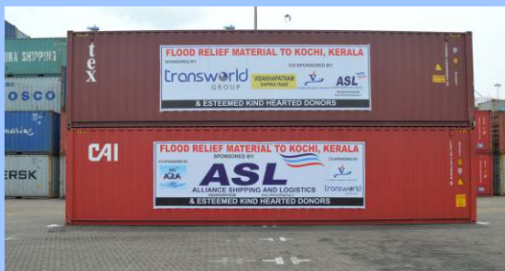
Flood Relief Material by Vizag's Shipping Fraternity. Initiated by ASL Shipping & Carried by Transworld Group