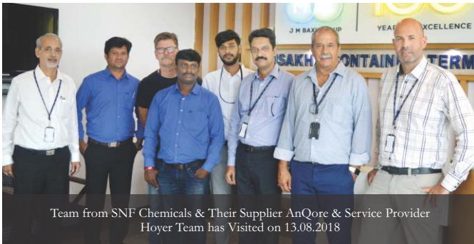
Team from SNF Chemicals & Their Supplier AnQore & Service Provider Hoyer Team has Visited on 13.08.2018