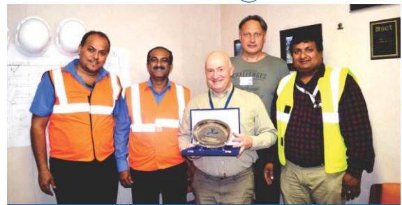
m.v. Herma P, TS Lines, 26 December, 2017