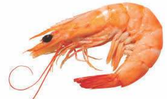
India tops in Shrimp Exports

Visakhapatnam which is the hub of Shrimp Exports with the presence of world class facility - Visakha Container Terminal (VCT) that has been handling Shrimp Exports over the years, topped continuously for 3 consecutive financial years in terms of Dollar Value. There has been a steady YoY growth of Shrimp Exports at VCT with an expected growth of 32% in 2017. Envisaging the growth to be higher in future too, VCT came up with upgraded reefer infrastructure where additional plug points were installed making it to the total of 366. VCT with its modern infrastructure continues to be the preferred gateway for seafood exports.