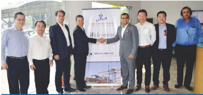
Wan Hai Team Visited VCT to study further opportunities and enhance their market share @ Visakhapatnam