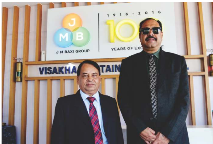
Delegates from Nepal Transit & Warehousing Co. Ltd.

Following the increased rail bound movement of Nepal Imports through Vizag, the trade is mulling over bringing more imports through the port city. To encourage the trade, Ministry of Commerce & Supplies has also held discussions with Nepal Transit and Warehousing Co Ltd (NTWC), the customs house agent for government cargoes, to import government cargo via Vizag port. To study the process of Nepal bound container movements through Vizag Port, delegates from NTWC visited Visakhapatnam in December.