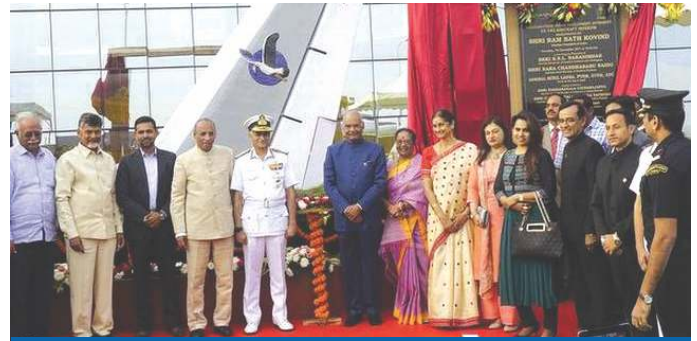
Inauguration of TU 142 Museum