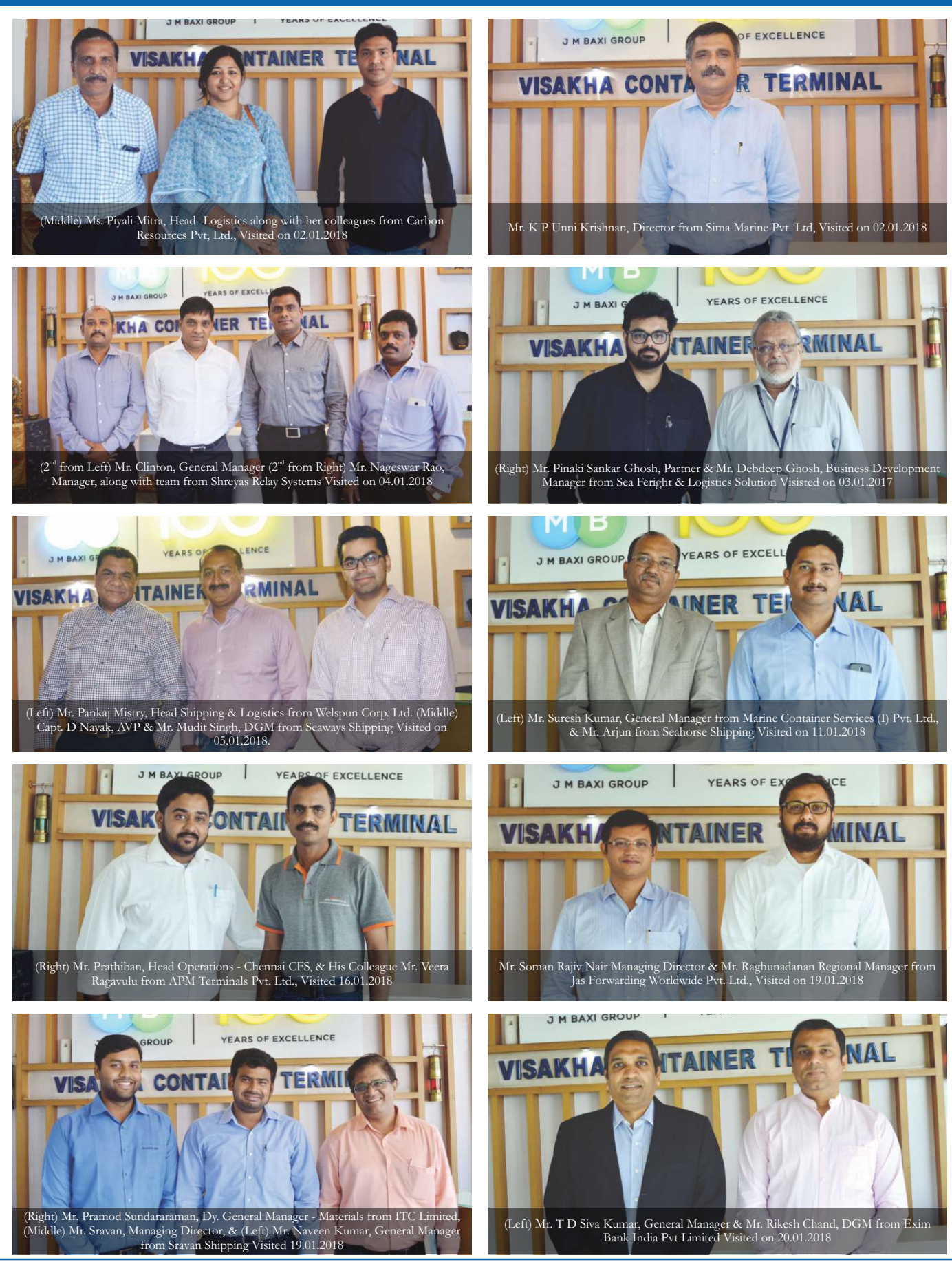
VCT - The Ideal Gateway on the East Coast of India