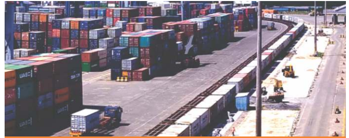
VCT- Rail yard being developed

While the expansion plan at the terminal is going at a rapid pace, to complement the continuous growth of the container movement through Visakha Container Terminal, development and improvisation on the land side is taking place as well. VCT has two full length on dock rail sidings that has been pivotal in the movement of rail from various regions of its unique hinterland. VCT has witnessed surge in the rail movement especially from the past few months which has crossed over 30 rakes and reached as high as 45 rakes per month to destinations like ICD Jharsuguda, ICD Birgunj, ICD Raipur and to the plants located at Kalinganagar, Jharsuguda etc. Not to forget that the connectivity with ICD Nagpur, Hyderabad & Delhi is also expected to start soon.