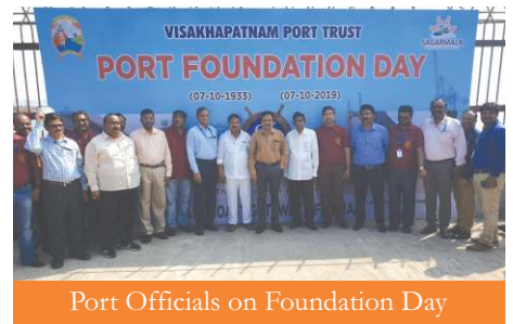
Port Officials on Foundation Day

Officials from various departments along with VCT's security staff were deployed to escort the visitors for Terminal round and to make them understand the operations and activities inside the Container Terminal. The environment at the port on the two days was filled with inquisitiveness by the public to witness and understand, how a port operates?