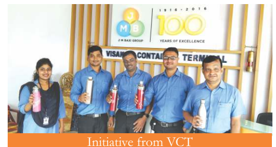
Initiative from VCT

The first call was taken to eliminate single use plastic bags, that were replaced with cloth bags. Later, the plastic water bottles with steel bottles. The management has set an example by providing steel bottles that are eco-friendly for the staff and eliminated the plastic bottles usage. In certain areas of the terminal, the glass bottles and utensils have been placed too. Apart from the aforementioned, awareness sessions and tips on plastic free lifestyle were shared with the VCT staff. VCTians have taken an oath to take more such initiatives to make the terminal, home and respective areas plastic free as much as possible for a bright environment friendly future.