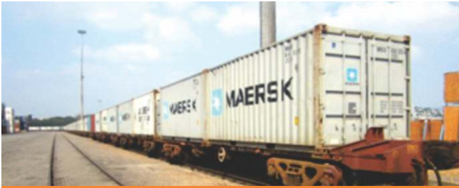
Rake to ICD Jharsuguda

Visakha Container Terminal (VCT) has been witnessing increased rake movement between various locations in the hinterland and to Nepal. Handling of these rakes has been done efficiently with an average time of 3.5 to 4 hours. VCT now handles about 45 rakes a month hassle free, meeting the requirements of the trade. Thanks to the trade for giving VCT a great opportunity to serve the vast hinterland bestowed with.