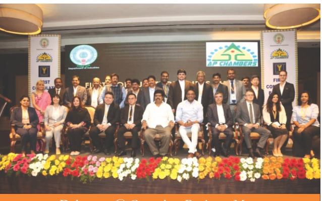
Delegates @ Consulate Business Meet

Consul General and Trade Commissioners from Russia, France, Italy, Iran, Thailand, Columbia, Canada, Australia, Belgium, Netherlands, Rwanda, Germany, Korea, Belgium and other countries attended the meeting. The objective of the meeting is to enhance "Two-way investment, Trade and Technology" flow from/to various countries to/from India and Visakhapatnam to be the medium for the flow. The